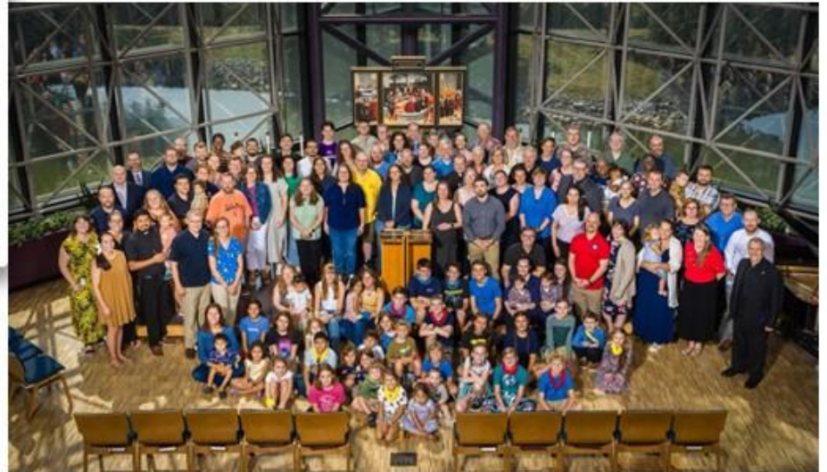
Your LCMS Latin America and the Caribbean Missionaries and their families

In early August, missionaries and their families from across Latin America and the Caribbean gathered in the chapel of the International Center in St. Louis for our annual missionary conference. The photo above, taken from the chapel's glass walls, captures a striking contrast: God's people gathered around His Word and Sacraments, while just beyond the windows, two major highways hum with the busyness of the world. It is a vivid reminder that the Church always stands at the crossroads of Word and world—called to be nourished in Christ and then sent back into the world to proclaim His Gospel. For us as missionaries, this yearly gathering is a vital part of sustaining the mission. It provides time for worship, rest, and encouragement in God's Word, while also offering opportunities for training, reflection, and collaboration. In the field, it is easy to become isolated or focused only on immediate needs, but the conference draws us back to the bigger picture: Christ's mission through His Church to bring the Gospel to the nations. By gathering, we are reminded that we do not labor alone, but as part of a larger body joined in the same confession, strengthened to return to our places of service with renewed zeal and hope.